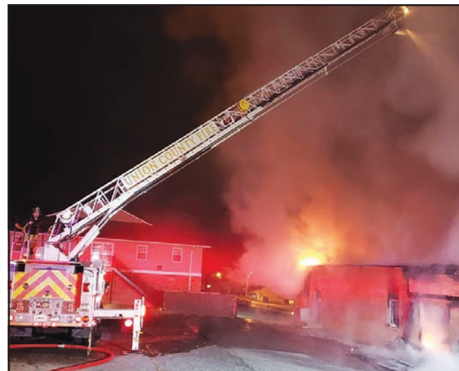
Union County Firefighters deployed Ladder 1 to attack the Spry Family Dry Cleaners fire from above on Thursday, Nov. 21.

Upon arrival, firefighters found that the part of the building containing the business' dry-cleaning equipment was fully engulfed in flames, and that, furthermore, the roof had collapsed.