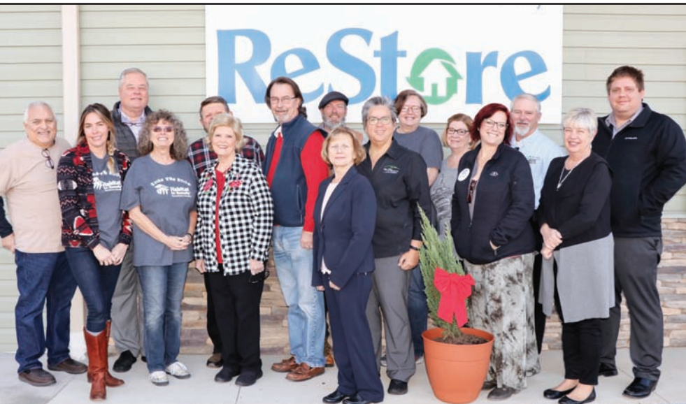
The Towns/Union Habitat for Humanity celebrated the grand opening of the new ReStore in Blairsville with friends, employees and customers on Monday, Nov. 18.